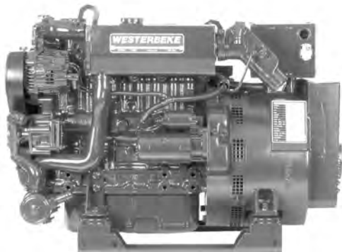
12.5 BTDB Diesel Generator